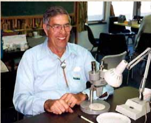
at Micromounters of New England Mineral Symposium, May 11, 1991