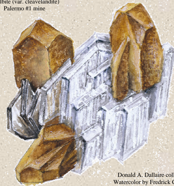
Donald A. Dallaire collection Watercolor by Fredrick C. Wilda

Hydroxyl-herderite crystals on albite (var. cleavelandite) Palermo #1 mine