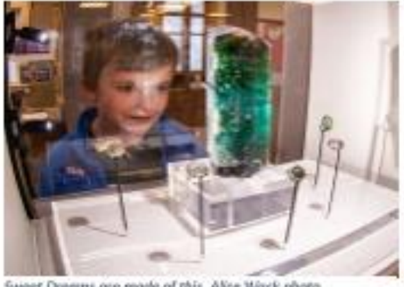
Sweet Dreams are made of this.

While some of you are probably thinking that you don't have time, ask yourself how many times someone has assisted you from the mineral community? Is now the time to start to pay it forward? Geology knowledge is slowly dying in today's society. Much of