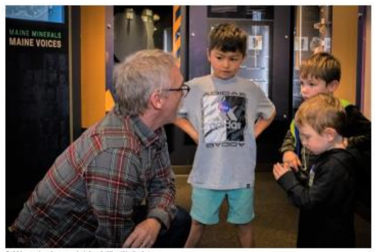
Robble getting down to their level.

Over the last few months, the Maine Mineral & Gem Museum has had a couple of community days where Maine citizens are welcome to visit for free. In November the Oxford County Gem & Mineral Club supplied volunteers to be docents for a day to help with the attendees that came. In March the Maine Mineralogical & Geological Society did the same thing. The Museum supplied a breakfast before the event for some socializing. We then did a short training to familiarize ourselves with the Museum lay out and go over safety procedures.