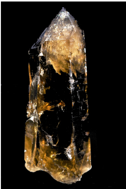
Smoky Quartz Les Droites Chamonix, France