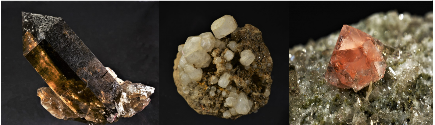
Left: Smokey Quartz, Cavradi Gorge, Tujetsch, Grabunden Canton, Switzerland Center: Flourapatite, Central St. Gotthard Massif, Leventina, Ticino, Switzerland Right: Flourite, St.Gotthard Tunnel, Reuss Valley, Goschenen, Uri Canton, Switzerland

Bring in your specimens from the Alps. Any country that includes the Alps is a candidate. Smoky quartz, fluorite, and fluorapatite are especially characteristic of the Alps.