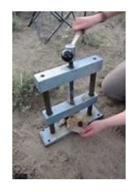
Above: Mechanical Rock Trimmer