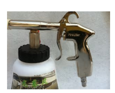
Above: High-pressure water gun.