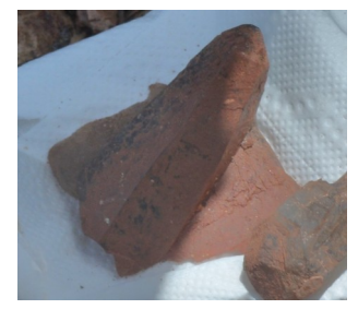
Above: Before cleaning on left after cleaning on right. Suzie Blue Claim, Florissant, Colorado.