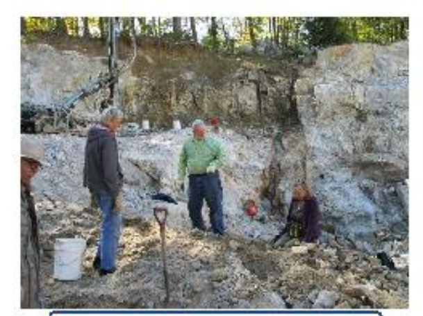
Members leveling a 4 foot pile searching for and finding elbaite