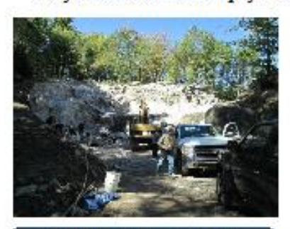
Hey Jeff, can I borrow that yellow CAT?

As everyone was searching for minerals Jeff Morrison began working the pocket area with an air hammer. Lo and behold two pockets were opened containing elbaite with approximately 15% gem material. Members got to see a real gem pocket but could only look. This is what pays the bills.