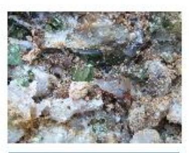
Gem elbaite section in place