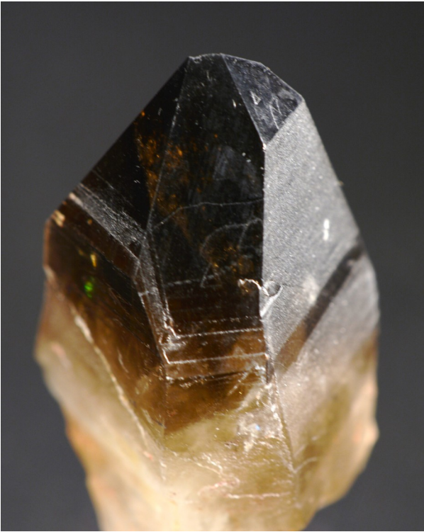
Above: Forgotten crystal that initiated return on Monday morning. Below: A very clean crystal with no damage and very gemmy 7 cm tall.