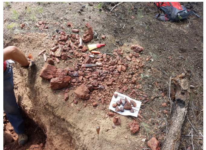
Above: Crystals & Crystal fragments from the pocket.