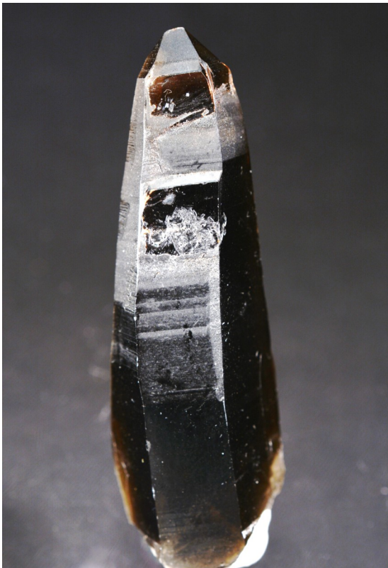
Above: One of the 2 largest crystals found 11 centimeters tall and very "fat" Right: Microcline crystal group - largest crystal 3.5 cm tall.