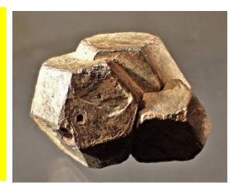
Left: Pyrochlore Supergroup var: Betafite A<sub>2-m</sub>D<sub>2</sub>X<sub>6-w</sub>Z<sub>1-n</sub> Silver Crater mine Faraday Township Ontario, Canada