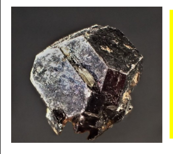
Left: Uraninite UO<sub>2</sub> Trebilcock Locality Topsham Sagadahoc County Maine