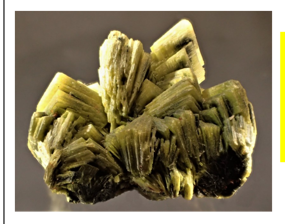
Left: Autunite Ca(UO<sub>2</sub>)<sub>2</sub>(PO<sub>4</sub>)<sub>2</sub>·11H<sub>2</sub>O Daybreak mine Spokane County Washington

After serving 6 years in the US Naval Nuclear submarine force he worked at the Portsmouth Naval Shipyard for 34 years in various radiological positions and has an extensive background in all aspects of radiation and radioactive material control.