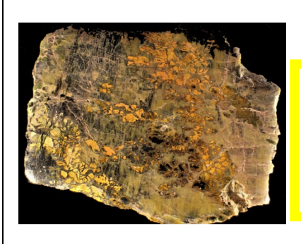
Left: Gummite a mixture of uranium minerals

The talk will also include a review of some radioactive minerals and how to find them with the proper equipment. He will also cover the safe way to keep radioactive minerals in your collection.