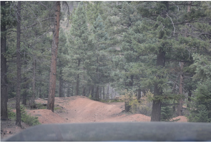
Left: Steepnes of road to claims - no 4 wheel drive, don't even try. Right: Dorris family claim marker.