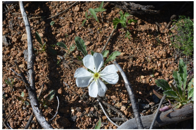
Above: Mount Antero still with enough snow to prevent prospecting Remaining photos: Typical wildflowers in the Crystal Creek area.