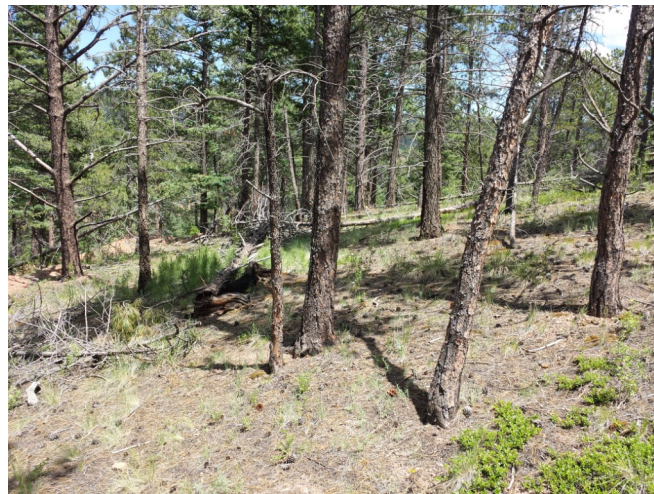
Above right: Area we were prospecting.