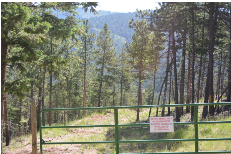
Above left: Gate to northern claim area.