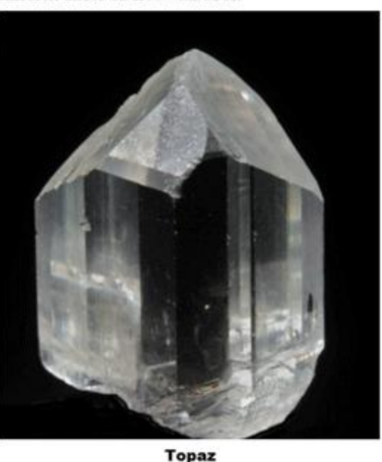
Greens Ledge Milan, New Hampshire

Gems-Jewelry-Minerals-Fossils-Carvings-Displays-Demonstrations and much more!