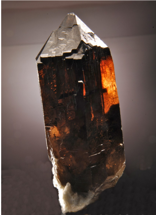
Smoky Government Pit Albany, N.H.

Naturally, with the topic of the September presentation, quartz should be the mineral for members to bring in to display. Bring not only your normal quartz specimens to show but especially the “weird” habits and shapes you have in your collection.