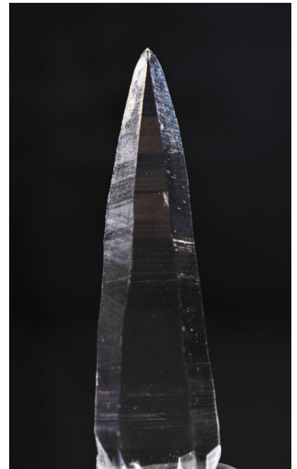
Tassin Habit Quartz