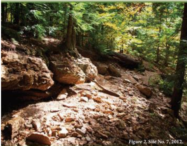
Figure 2. Site No. 7, 2012.