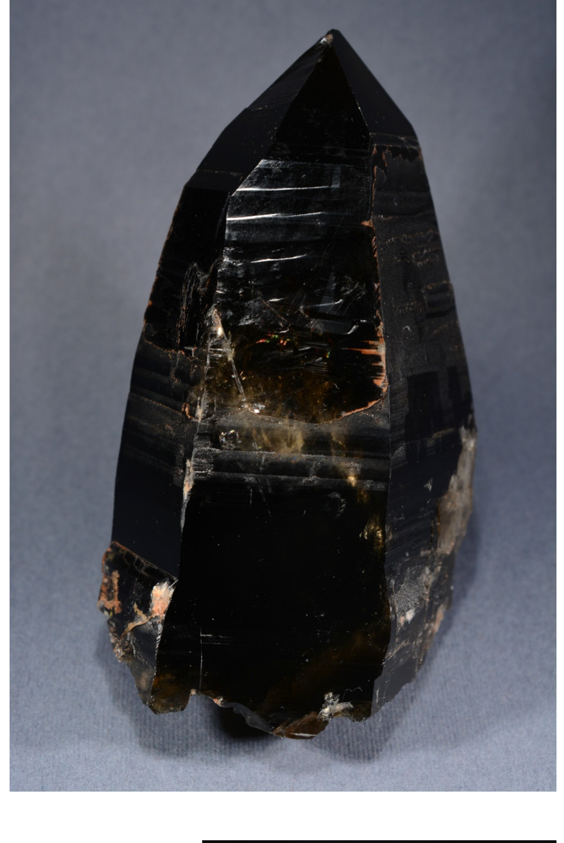
Above: One of the 2 largest crystals found 11 centimeters tall and vey "fat" Right: Microcline crystal group - largest crystal 3.5 cm tall.