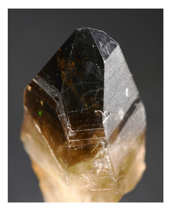
Above: Forgotten crystal that initiated return on Monday morning. Below: A very clean crystal with no damage and very gemmy 7 cm tall.